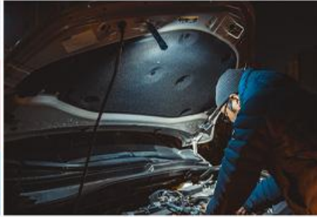
▲ Attach it