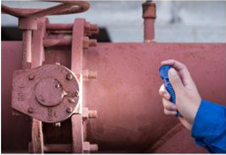
▲ Carry it