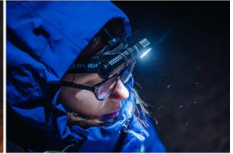
▲ Wear it

With the provided pocket clip for every day tasks or as a headlamp with the optional magnetic head strap.