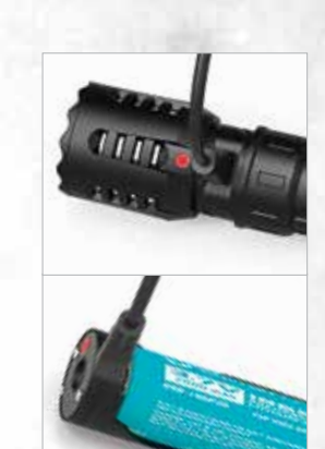
Charge the battery while in the light, and charge your spare battery while using the light.