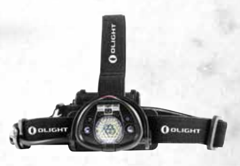
Optional top strap for added security during high-impact activities.