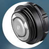
▲ Javelot Turbo