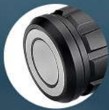
▲ Javelot Pro

The signature 3-in-1 tail cap (same as the Odin) fits securely with our lockable ROD remote pressure switch. Handheld or mounted, the choice is yours.